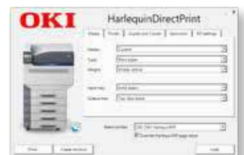
Harlequin DirectPrint RIP

PANTONE ® libraries are included in the Harlequin DirectPrint RIP, to ensure accurate colour matching job to job. For details on the optional RIPs, please contact your OKI representative.