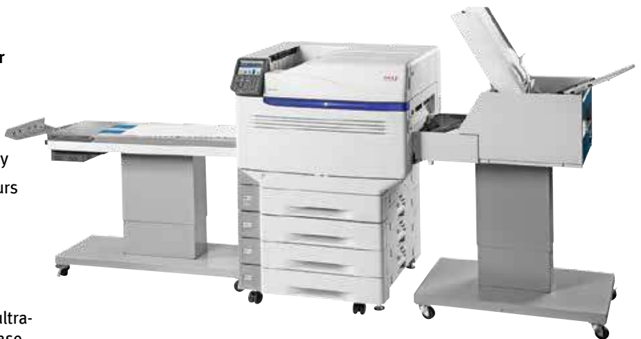
Shown: Pro9542DP+ Envelope Print System (Printer/Feeder/Conveyor/LCF). Also available: Pro9541DP+ and Pro9431DP+ systems.