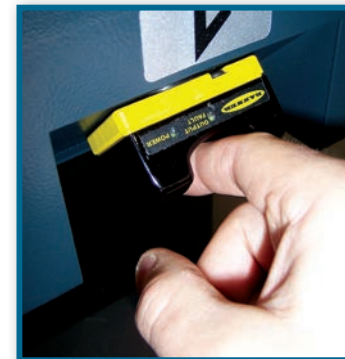
Challenge Exclusive Ergo-Touch Button (optional)

Challenge's EXCLUSIVE Ergo-Touch Cut Button option provides protection from one of the most repetitive movements required of a cutter operator - the continual pressing of the cut buttons during the cut cycle. The Ergo-Touch cut button system requires the same dual handed interaction from the operator but does not require him/her to hold in place a spring pressured button. This system only requires that the operator's finger be present in each cut switch device during the cut cycle providing ergonomic relief on the operator's hands and wrists.