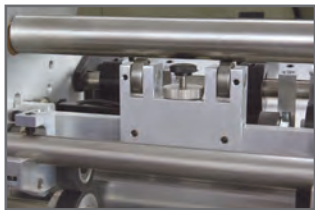
CAM Actuated Compression Crease

The COUNT™ AccuCreaser Air provides fast, consistent quality creasing and perforating with a variety of features that make it top of its class. Get super accurate CAM actuated compression creasing with rotary perf/score capabilities, including micro-perf (up to four at a time), and automated distance recognition to support auto set-ups for a variety of creases, even perfect bind set-up. The AccuCreaser Air utilizes a bottom vacuum paper feed with a built-in register guide to ensure accuracy with every sheet.