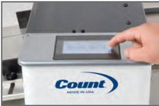
Touch Screen Controller

The COUNT™ iCrease Pro + is a robust solution for creasing and perforating digital media to eliminate cracking when folding. Get the automation of bigger COUNT machines in a simple hand-feed machine anyone can use. The iCrease Pro + can crease and perf in one pass (no need to refeed!), with multiple crease locations and perfect bind covers, with choice of automatic hinge placement or no hinge.