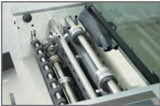
CAM Actuated Compression Creasing

Combines creasing and perforating in one simple yet powerful machine.