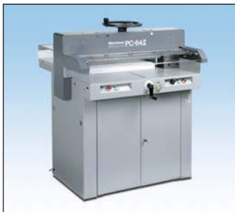
PC-64IISC Paper Cutter Cutting Width 64 cm (25.1")