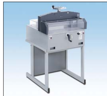
PC-45SC Paper Cutter Cutting Width 44.6 cm (17.5")