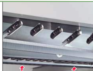
False Clamp Plate