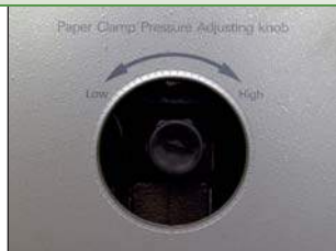
Adjusting Knob for Clamp Pressure