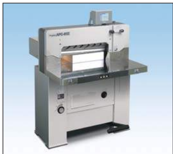
APC-61II Programmable Hydraulic Cutter Cutting Width 61 cm (24.0")