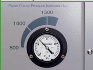
Clamp Pressure Indicator